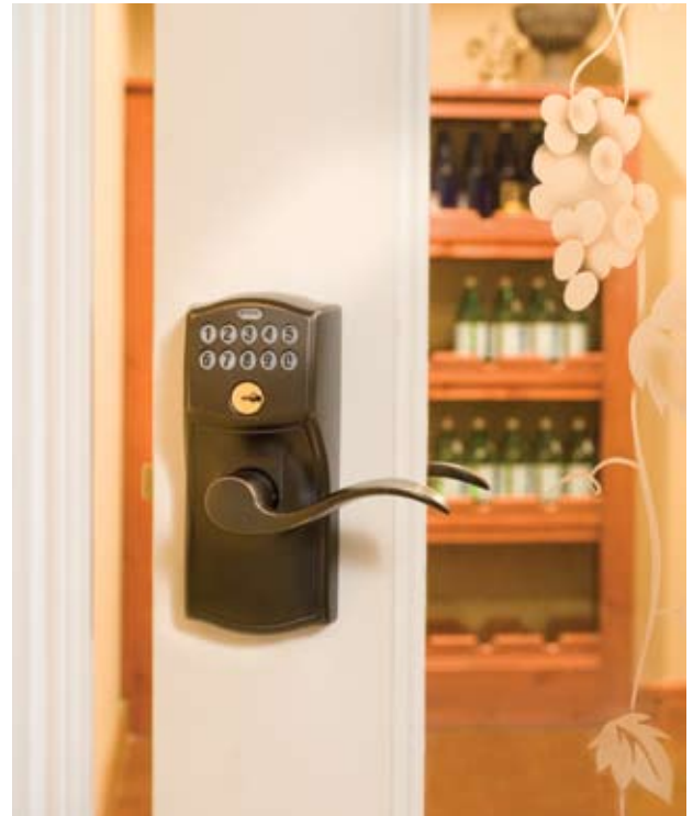
Styles shown: Plymouth Satin Nickel with Flair lever (left) and Camelot Aged Bronze with Accent lever (above)