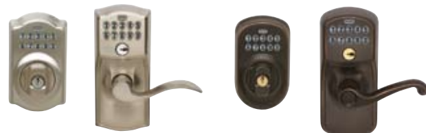
Camelot Satin Nickel Finish

Schlage Keypad Locks are available in two popular designs – Plymouth and Camelot – with knob and lever styles, as well as finishes to complement any décor, including bright brass, satin nickel, antique brass and aged bronze.